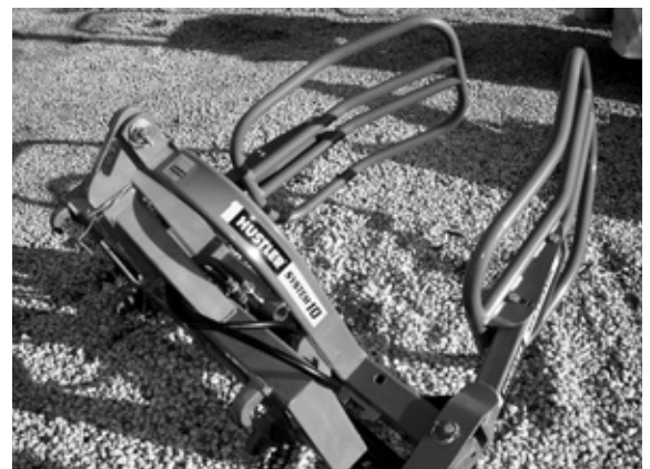
4. Wrapped silage grab.