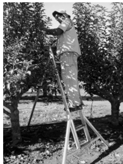
6. Fruit picking ladder.