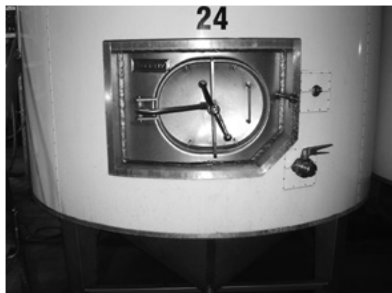
2. Vats with inlets, outlets and controls near ground level.