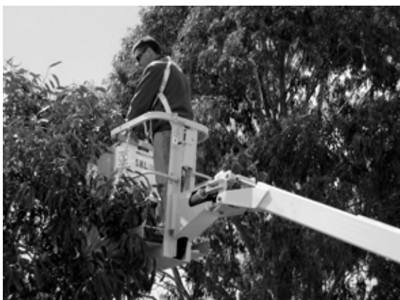
5. An elevating work platform (EWP).