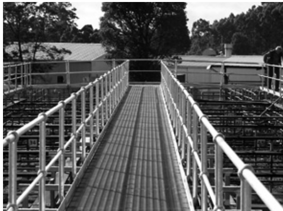
7. Animal sales yard, showing correct use of handrails and edge protection.

For information on loading and unloading trucks, see also Section 6.4 of this guide.