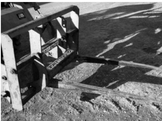
3. Round bale fork attachment.